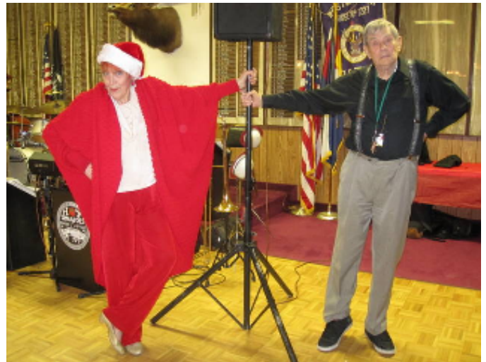
These are scenes from the December 2011 DJC Christmas Potluck. Jazz lovers know how to party!