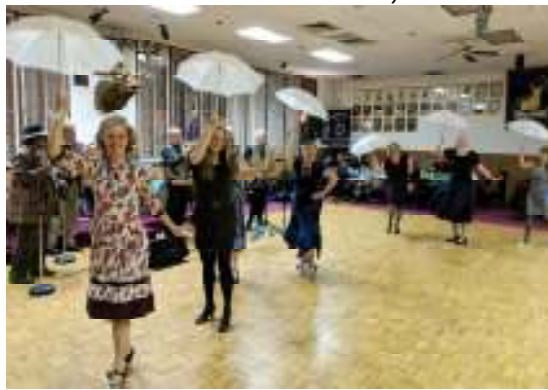
The Parasol Parade in full swing!