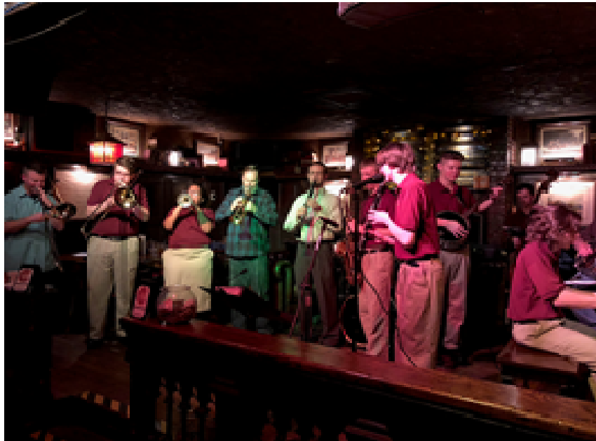
DJC Youth All Stars performing with Your Father's Mustache Band at the Bull & Bush Pub on January 28th

Our exciting New York City concert tour will be taking place from July 7th through 13th!