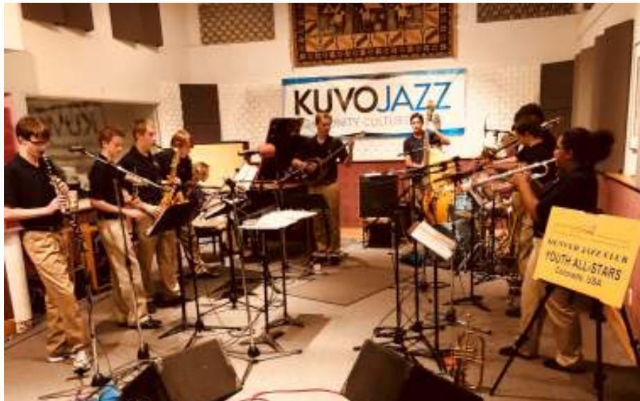
DJC Youth All-Stars Performing live on the air at KUVO Jazz on June 12th

Please go to: http://youthallstars.denverjazzclub.com/donate/ to order CDs or make a donation to our band!