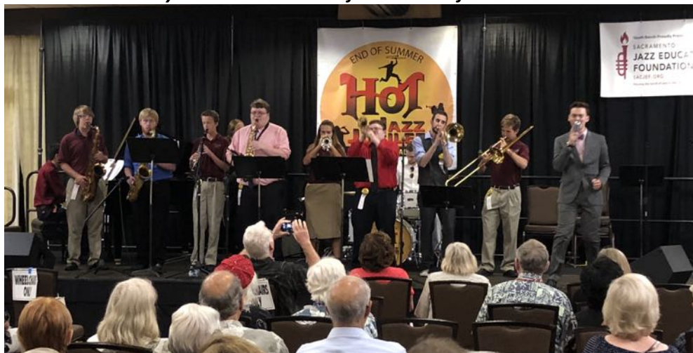
DJC YOUTH ALL-STARS Performing with Bay City Swing at the 2018 Sacramento Hot Jazz Jubilee

Thank you Denver Jazz Club for a wonderful concert tour!