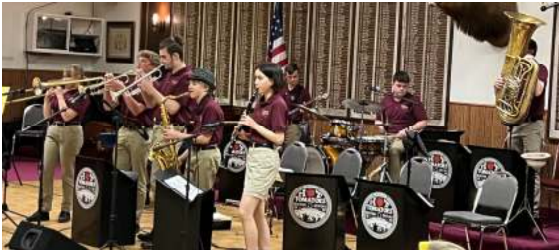
Denver Jazz Club Youth All-Stars Westminster on April 10, 2022

A special thanks to all of you in the Denver Jazz Club for your unending support! Thanks to all of you who participate in the King Soopers fundraiser – this program continuously helps our youth all-stars!