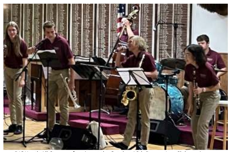
DJC Youth All-Stars performing at the October 16th Denver Jazz Club session

Congratulations to the Denver Jazz Club Youth All-Stars for being selected to perform at the Sounds of Mardi Gras Jazz Festival in Fresno, California, February 10-12, 2023! After Fresno, our next tour will be to New York City in July of 2023!