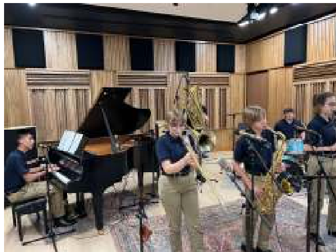
Performing live June 14 on the radio at KUVU!

The Denver Jazz Club Youth All-Stars recorded their 13th CD, Out of the Blues , on June 7th.